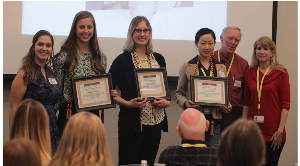
New inductees from the 2016 Induction Ceremony!