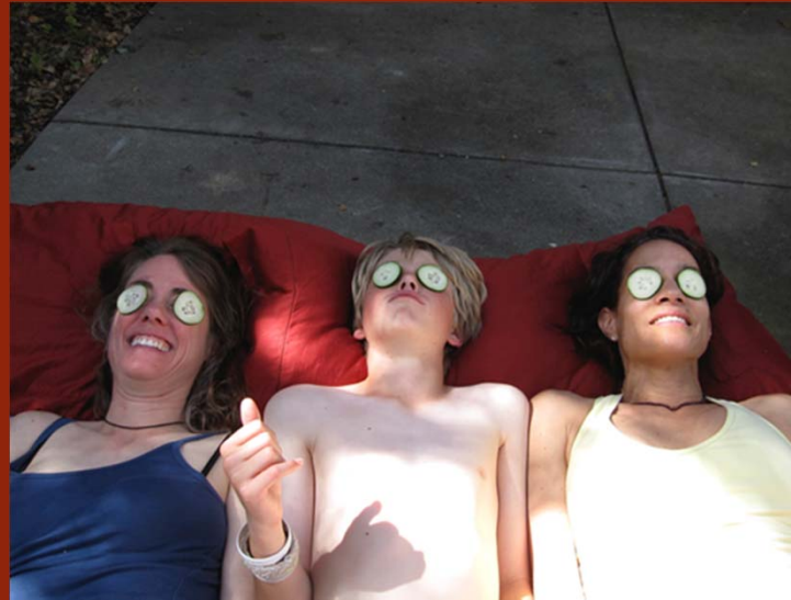
Relaxing at the Spa