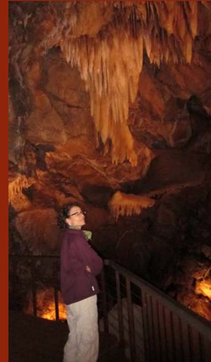
Exploring New Worlds